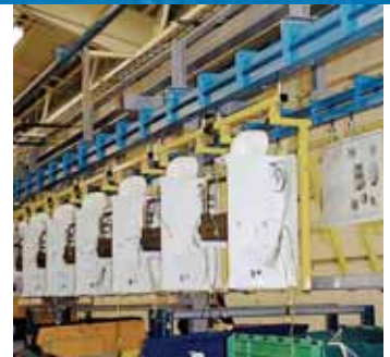
Assembly of high efficiency furnaces on the S-310 Power and Free conveyor .