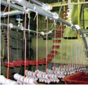
Dip paint finishing of lifting hooks in confined area with steep elevation changes using C-250 enclosed track conveyor .