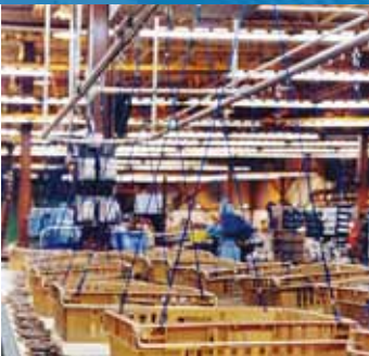
Small motor components transported in suspended baskets or totes on C-250 overhead conveyor .