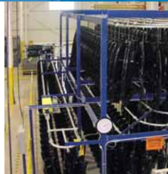
Unfinished automotive components accumulating on a multi-level C-250 enclosed track conveyor .