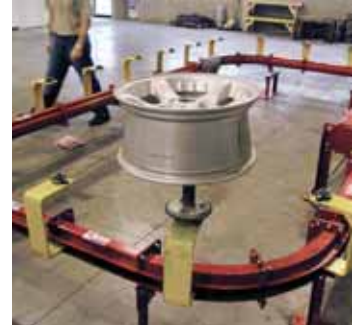
Finishing of automotive rims on rotating spindles using "slot sideways" enclosed track S-60 conveyor .