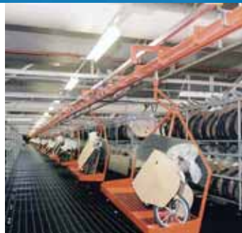
S-60 overhead conveyor to transport bicycles through manufacturing to shipping.