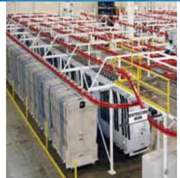
Automotive parts in an S-310 live storage system allows for unexpected production stoppages at supplier without impacting on final auto assembly plant.