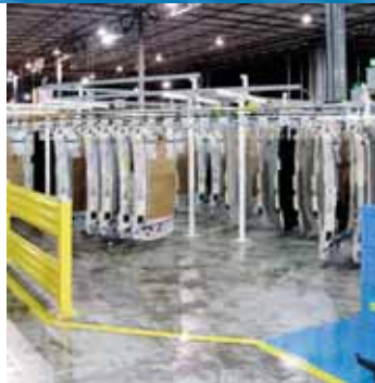
Automotive components stored in a C-250 automated storage and retrieval system facilitates batch building, retrieve to broadcast.