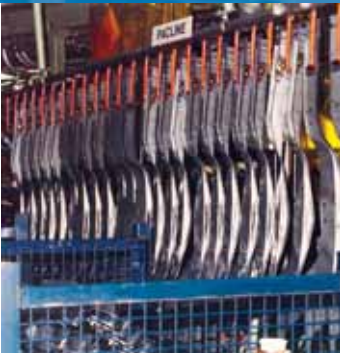
Manual, over/under parts buffer loop for automotive frames. Parts transferred from work station to work station using C-250 conveyor system .