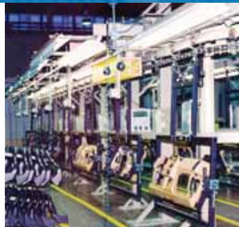
Automotive instrument panels transported through assembly process on I-beam overhead conveyor system with ergonomic carriers that tilt.