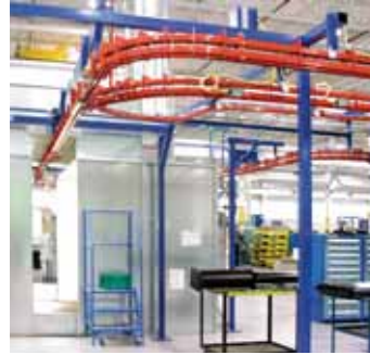
Wet spray painting of pneumatic cylinders using S-310 Power and Free conveyor .