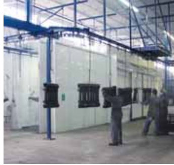
Wet spraying of heavy truck suspension components on I-Beam conveyor .