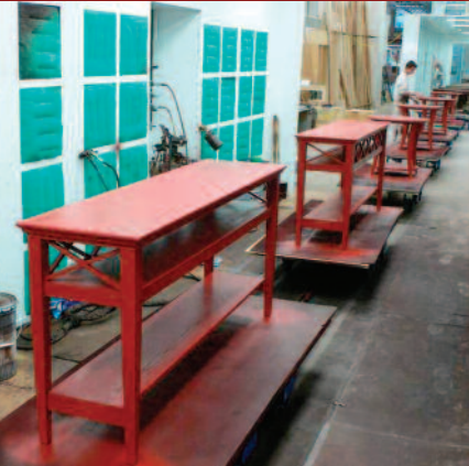
Paint line application