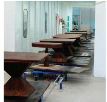
Custom platen with rotator