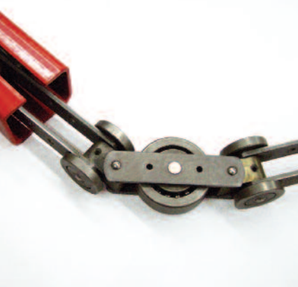
Hardened chain with low-friction bearings