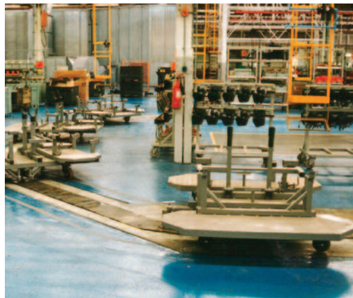
Track mounted in-floor